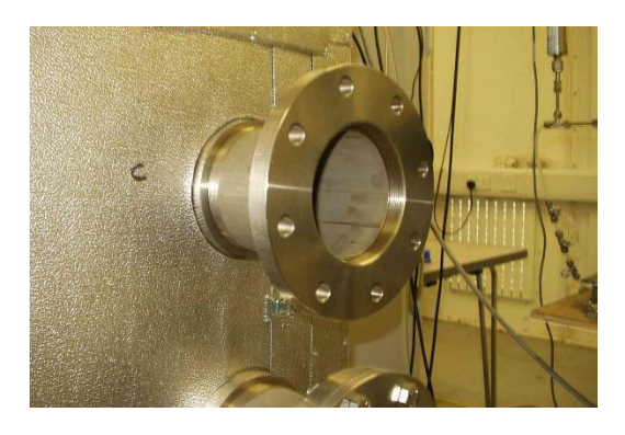
Figure 1: Stack simulator 5-inch port

2.1 The scheme will use the stack simulator at the NPL site. The NPL stack simulator produces a wide range of simulated stack gases under controlled conditions. The simulator is a recirculating system, which recreates a cross section of a 1.5 m duct. Four standard 5-inch ports are available for sampling probes or cross stack instruments to be installed. The 5-inch ports will be available to participants, normally on a basis of 1 port per participant . In addition, a number of extractive gas analysers may be connected to gas extraction ports. The gas extraction ports will be used for reference measurements and are not available to participants.